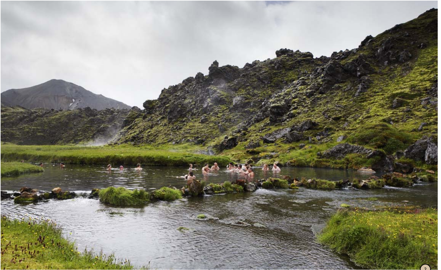
📷 NATURAL HOT SPRING IN LANDMANNALAUGAR