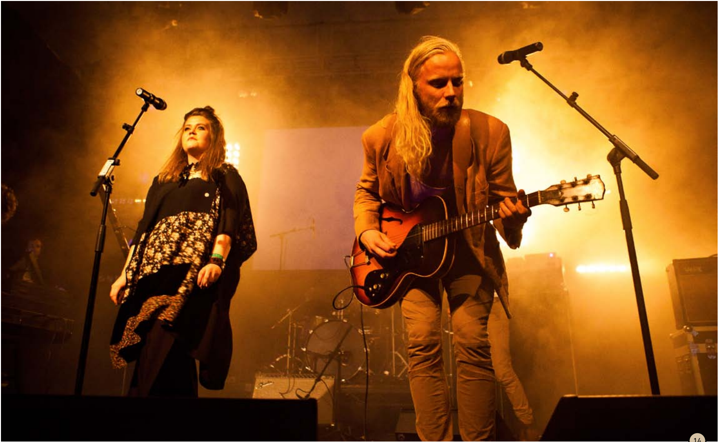
THE VIBRANT ICELANDIC MUSIC SCENE IS ALWAYS GEARING UP FOR THE NEXT FESTIVAL